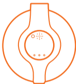
1x Automatic Medication Dispenser